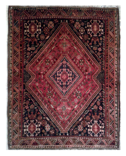
A reasonable approximation of the Dude's rug in the film "The Big Lebowski". It really tied the room together.

Contact ASTi to learn more about our RHEL 6 and 7 support.